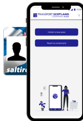
Correct position for Android